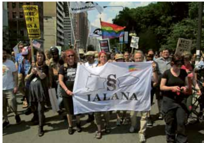
Anti-NATO Protests Chicago

For more information: www.lcnp.org/RMI & www.nuclearzero.org