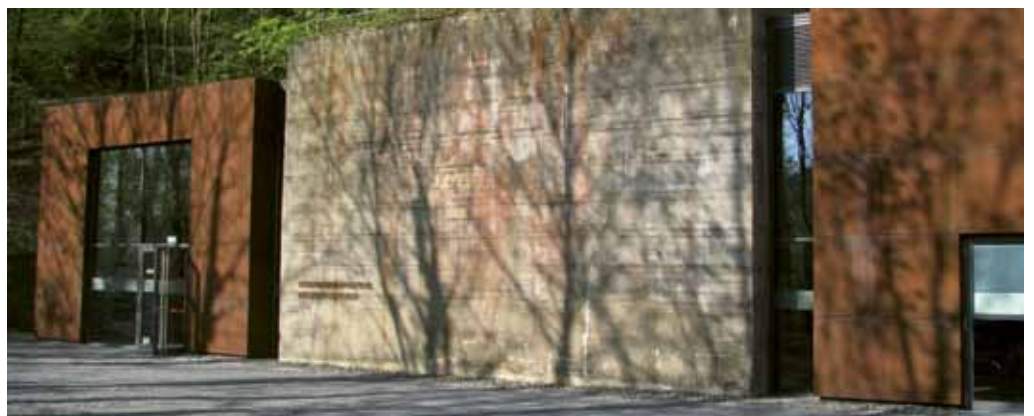
Nuclear Bunker of German Government in Ahrweiler

We call for the abandonment of all research and teaching for military purposes and urge the university authorities and the responsible academic bodies everywhere to adopt binding commitments in the university statutes similar to Civil Clauses in some countries.