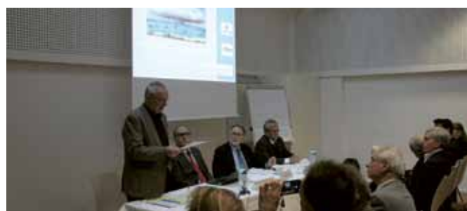
Event on RMI Nuclear Zero Cases