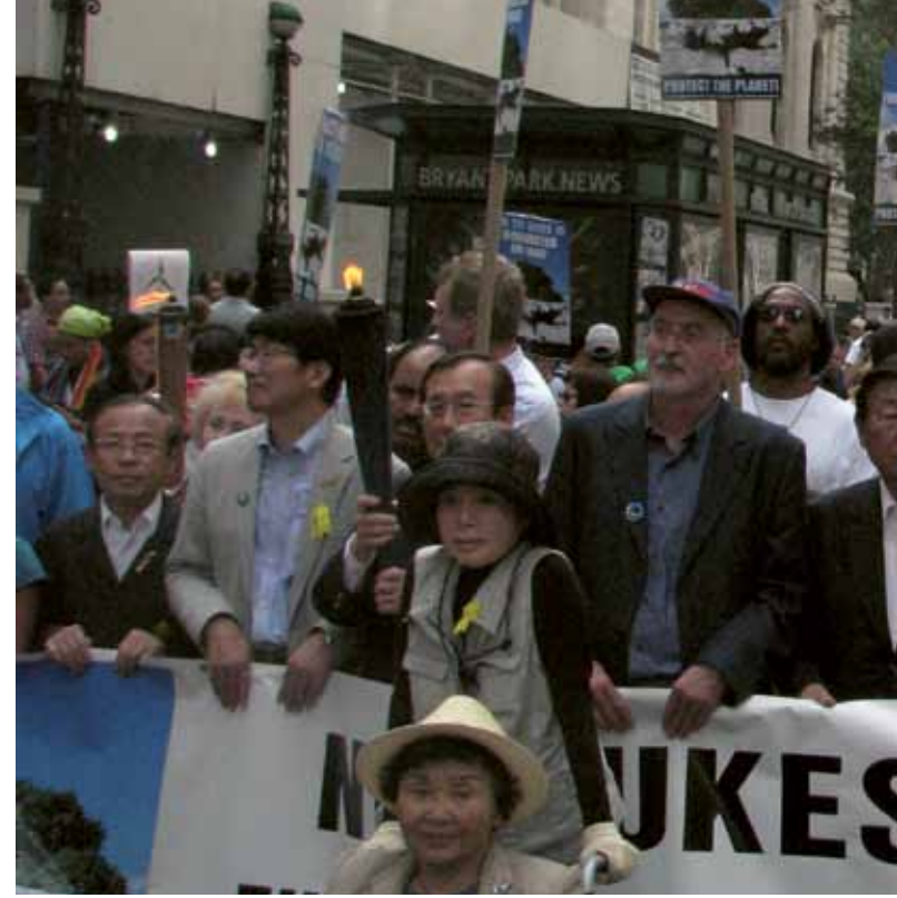
Demo at NPT 2010

We, Japanese lawyers against nuclear arms, will go to New York, the venue of NPT Review Conference, in order to urge the world leaders to eliminate all nuclear weapons under a legally-binding international agreement, and to put an end to the nuclear age.